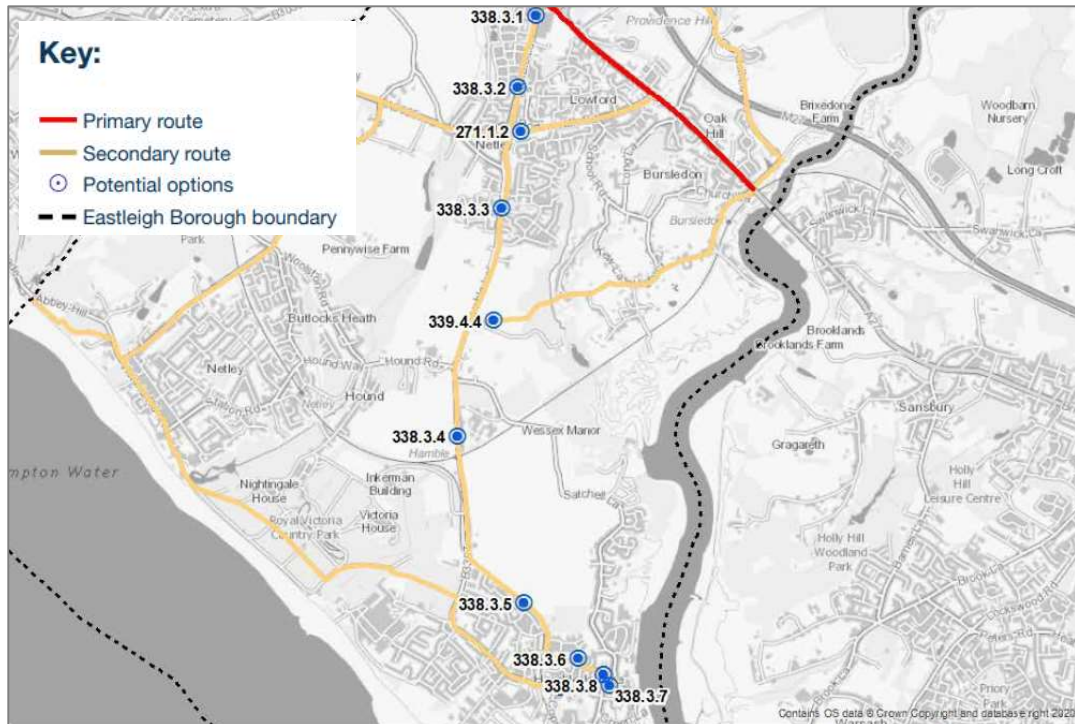
Image 13.4: Extract of Eastleigh LCWIP Windhover Roundabout to Hamble Lane Improvement Plan