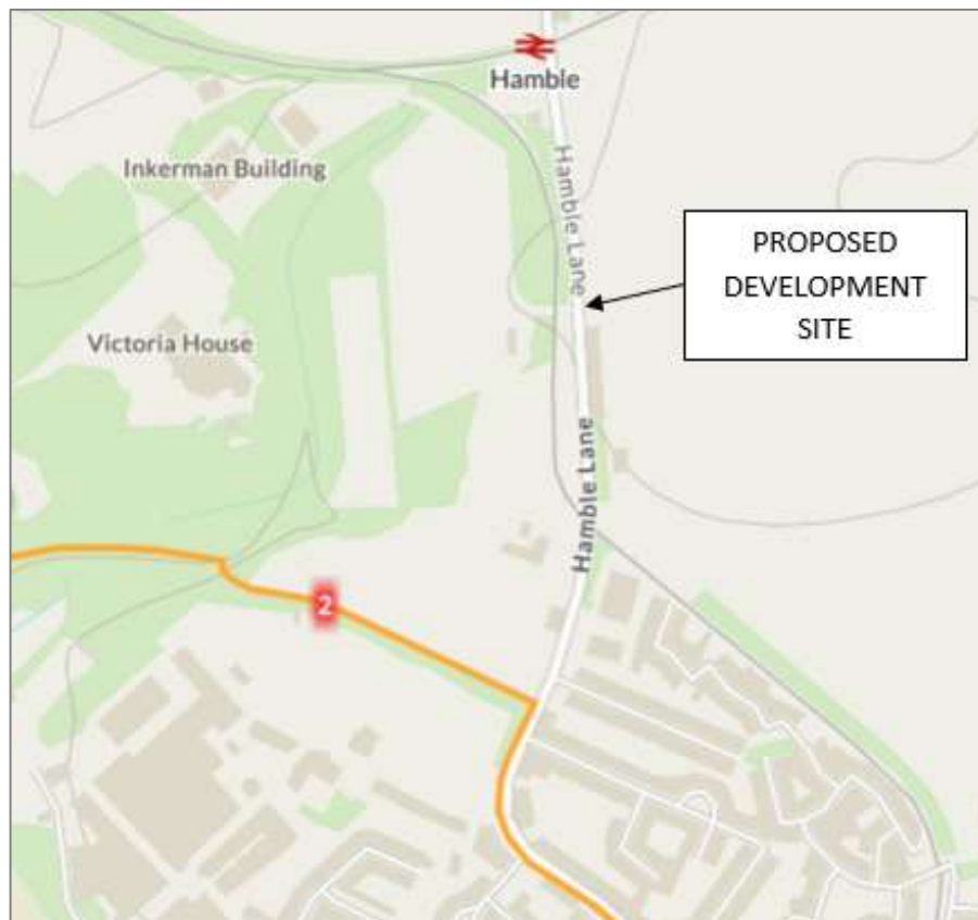
Image 13.3 Extract of National Cycle Route 2

Source: Sustrans National Cycle Network Map